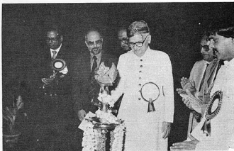
His Excellency inaugurating the Conference by lighting the lamp.