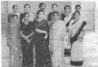
Selected women farmers with training Co ordinator