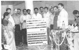
Sign boards in English and Kannada being placed in the village.