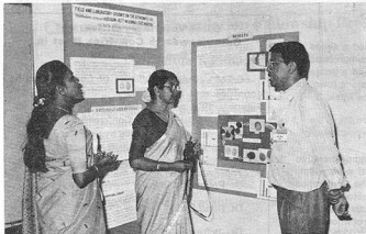
Poster Session at the Conference