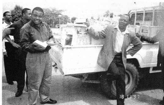
Books being delivered at the Library, School of Vet. Medicine. Lecturers of the school look at the books.