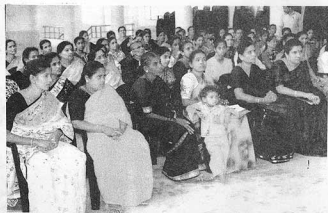
Section of Audience