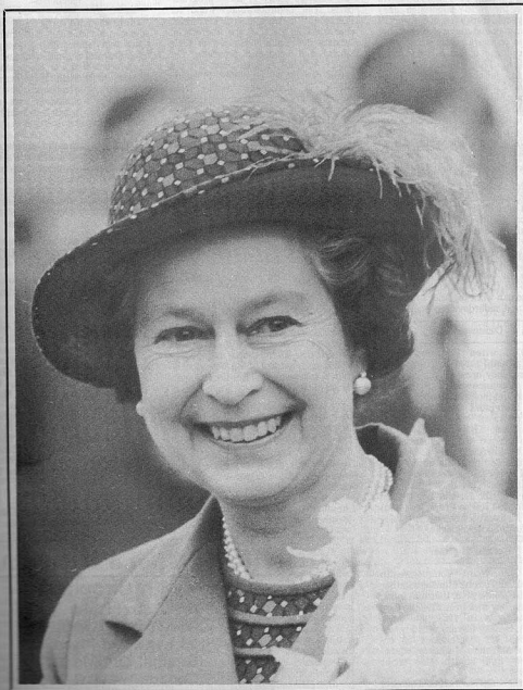
Head of The Commonwealth, Her Majesty Queen Elizabeth II

The Commonwealth is a voluntary association of independent sovereign states, consulting and co-operating with each other in the interests of all their peoples and in the promotion of international understanding and world peace.