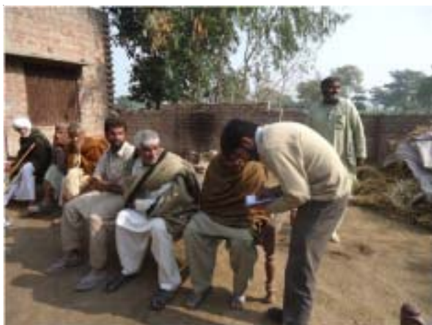
Interacting with Farmers