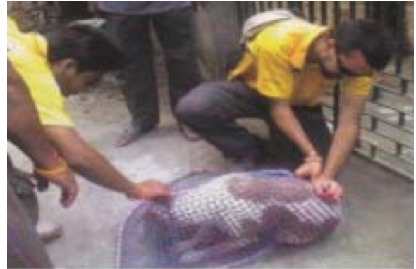
A dog being vaccinated against rabies in Kolkata

More than 45,000 dogs in India have been vaccinated against rabies in just 24 days, thanks to the efforts of a team of international volunteers and local people and organisations working on behalf of Mission