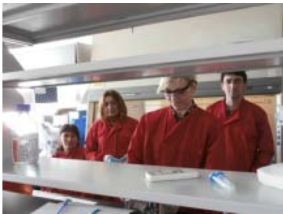
Laboratory training in Azerbaijan