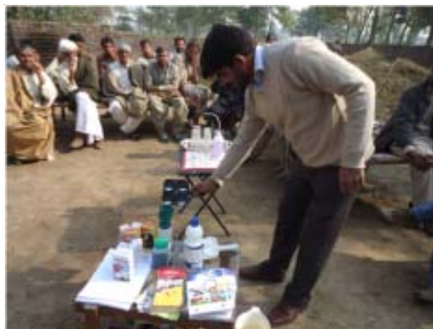
Demonstration of Surf Field Mastitis Test