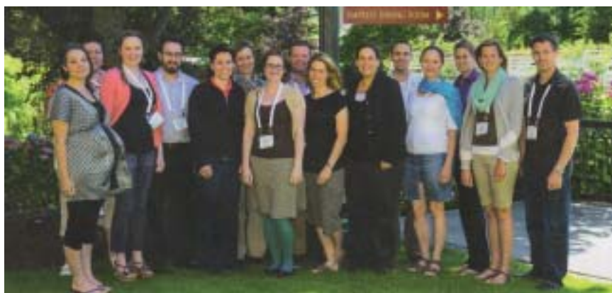
Some participants of the 2013 Emerging Leaders Program

The CVMA Convention is the first veterinary convention in Canada to launch a mobile convention application (app). Delegates could find session descriptions, speaker biographies and photos, attendee profiles, and interactive personalized agenda and real-time polls and surveys on this app; 499 participants downloaded this app and more than 23,500 page views were registered.