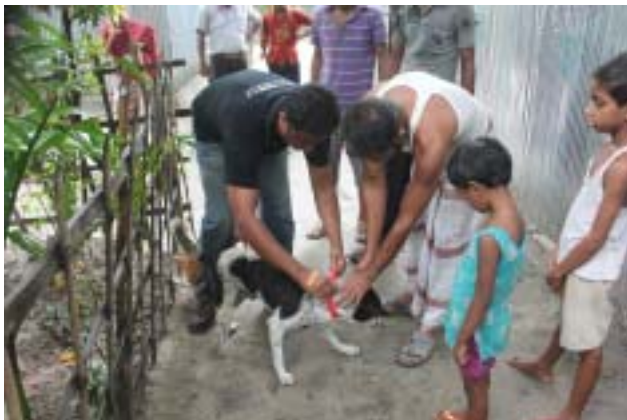
A dog is given a red collar to show that he has been vaccinated against rabies in Cox's Bazar, Bangladesh, while his owner and family look on.