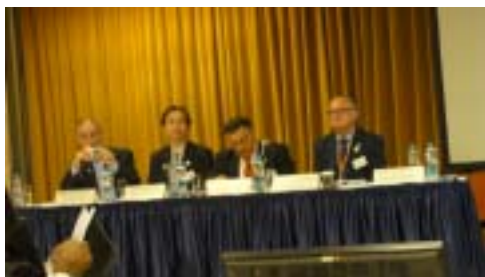
WVA General Assembly

The WVC 2013 was concluded by a presentation from the Turkish Veterinary Medical Associations, the organizers of the 32nd WVC to take place in September 2015 in Istanbul, Turkey.