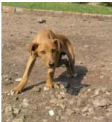
Dogs are a reservoir for rabies in many parts of the world

The BVA is proud to highlight the work of British vets in the fight against rabies: